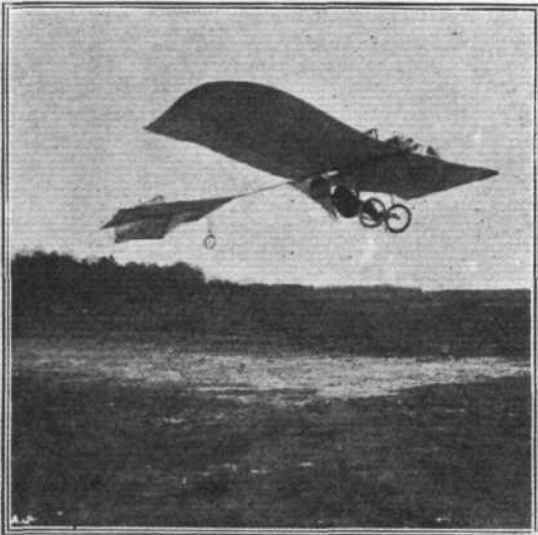
The First All-German Flyer.—Herr Grade is seen in the above view on his monoplane during the flight on Saturday last at Bork, which secured for him the £2,000 prize offered by Herr Lanz for the first German to describe a figure "8" round two posts placed a kilometre apart.