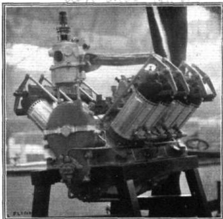
The 60-h.p. Wolsley.

LEADING particulars of the 60-h.p. Wolsley engine for aeroplanes:—8 cylinders; 3\frac{3}{4} in. bore; 5\frac{1}{2} in. stroke; four cycle; water-cooled; guaranteed to develop 60-h.p. at 1,200 r.p.m. for 4 hours; fuel consumption, \cdot 75 pint petrol per horse-power hour under above conditions; weight, 300 lbs., including all accessories (except the radiator).