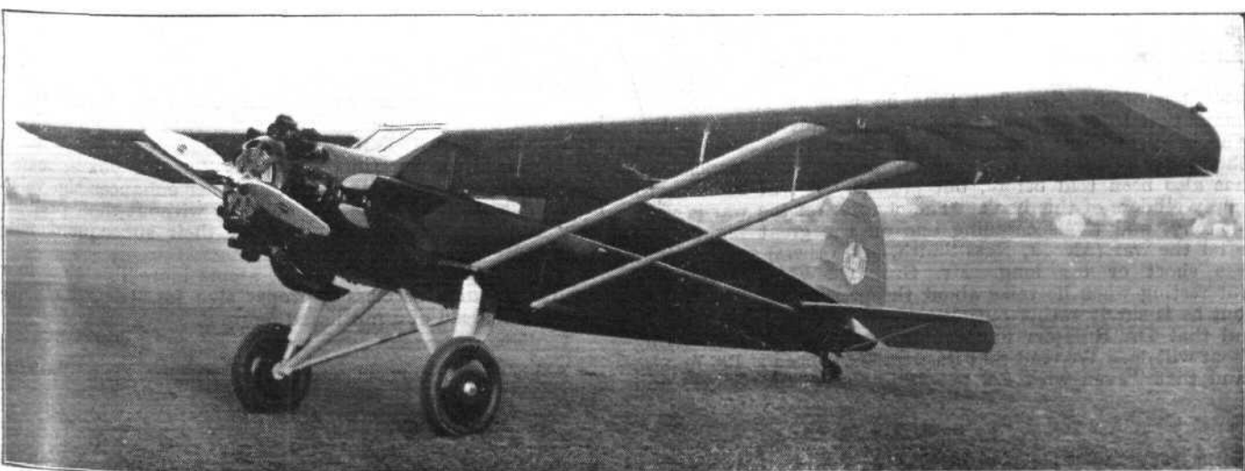
DIESEL-ENGINES: This Verville "Air Coach" will, it is claimed, fly from Chicago to New York at 105 m.p.h. on four dollars' worth of the special fuel oil used. The maximum speed of the machine is 130 m.p.h. The Packard Diesel engine is rated at 225 b.h.p.

FOR reasons of economy the Egyptian Government has decided to reduce the number of aircraft to be purchased to form the nucleus of an Air Force from ten to five.