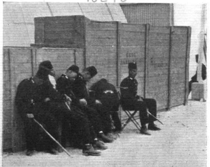
"WAITING FOR SOMETHING TO TURN UP" : Egyptian Police during the absence of competitors on the Circuit of the Oases.