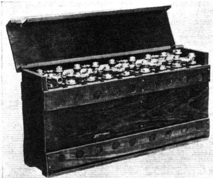
One nine-cell unit, Type AMS5 of a twelve-volt NIFE starter battery, two of which are fitted in each Empire flying boat. (Batteries, Ltd.—Para. 233.)