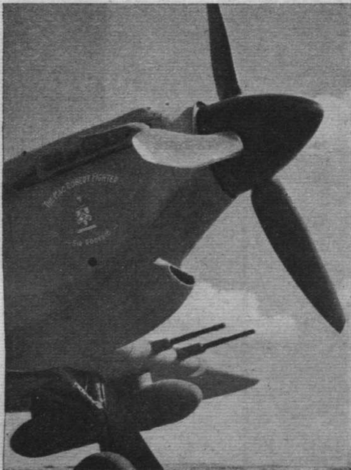
The Hurricane IIC as employed in the Middle East. It has tropical radiator and air intake, two 20mm. Hispano cannons in each wing, long range tanks which are interchangeable with bombs and ejector exhaust stubs.

TAKE the skill, courage and devotion of the fighter pilots during the Battle of Britain. Take the determination to oppose the enemy, no matter what the odds and where the place. Take the perfect co-ordination of man and machine—and you have some assessment of the