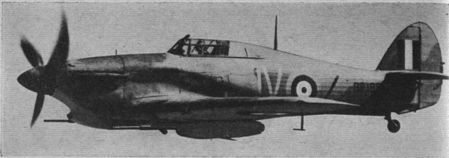
IN ITS LATEST FORM: Officially designated the Hurricane IID, this type with its two 40mm. cannons is more picturesquely known as the Tank Buster.

THE Hawker Hurricane has, without doubt, proved itself to be the most versatile weapon of this war. On these pages the Hurricane is shown in a number of its many types—from the prototype which flew in 1935 to the new 40 mm. cannon-armed tank attack IID model, which has played such a large part in the series of victories of the 8th Army.