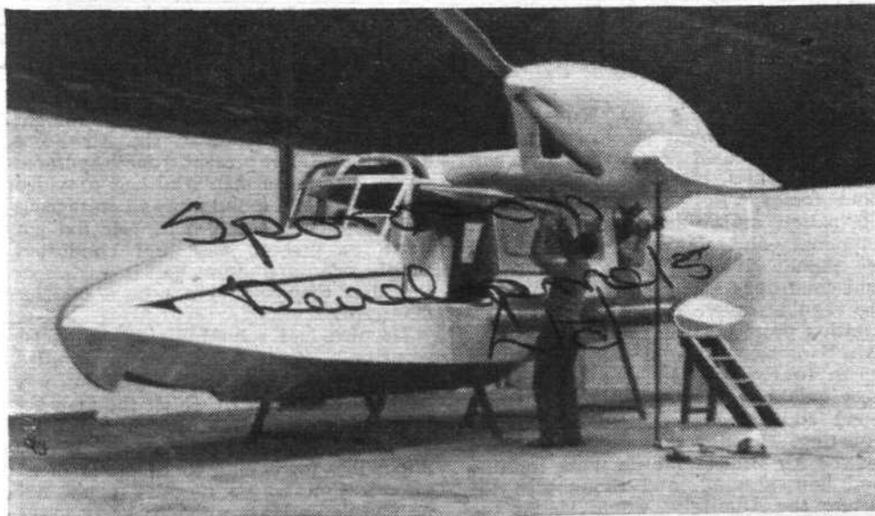
TAKING SHAPE: The mock-up of the Sponson Tribian II 5/6-seat amphibian, built by the Tiltman Langley Laboratories at Redhill. This version has a wing span 4ft greater than that of the 3/4-seat Tribian I, and will be powered by two Gipsy Queen 6s or Cirrus Bombardiers. Later export models for Canada and America may have Continental engines of equivalent power.