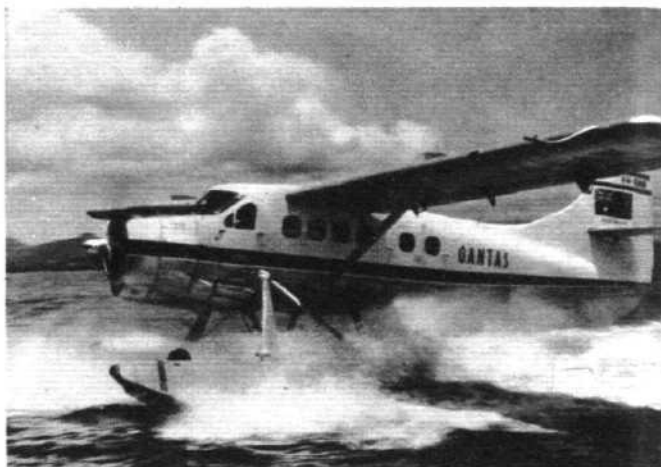
Jim Conway, the Otter pilot just visible, dumped me on the catamaran which serves as a pontoon and did a "few runs kicking up foam for pictures . . ."