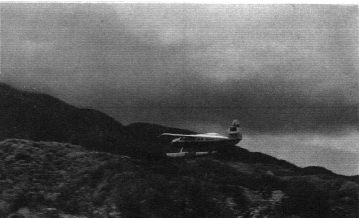
then took-off and left me in splendid isolation. Never mind, it's a beautiful spot. The water's clear blue, the sun blazes, and the Otter won't call again until Saturday week