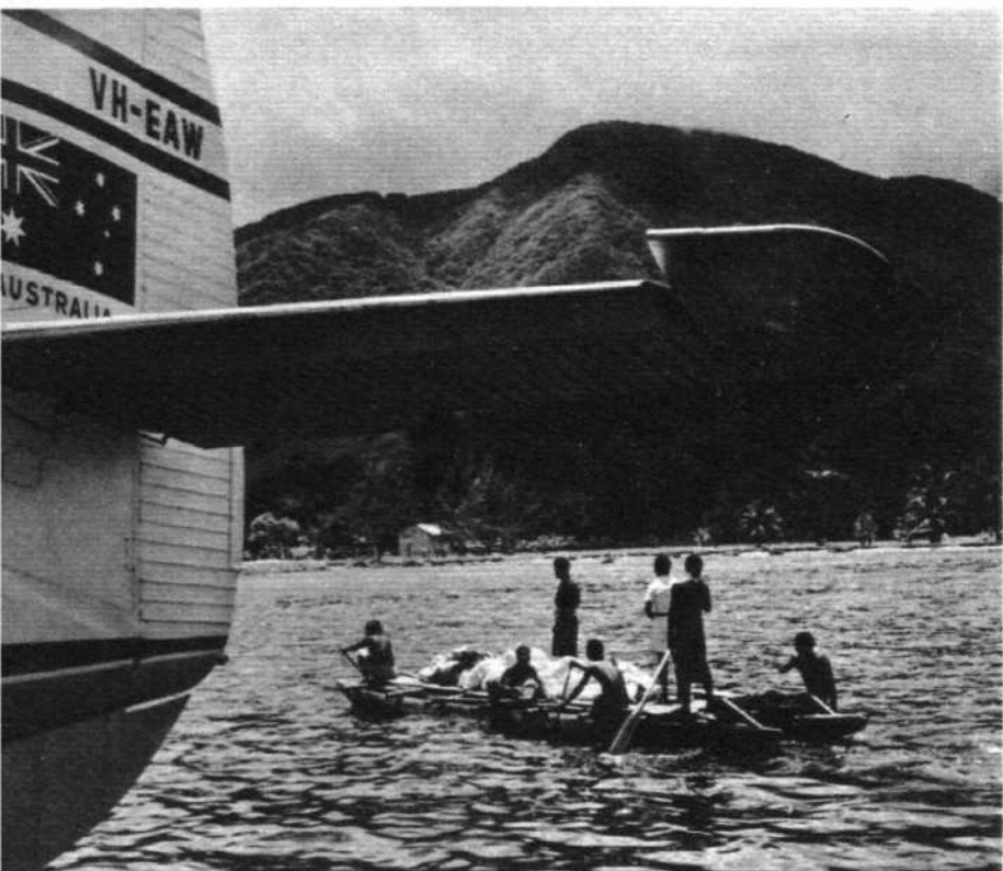
End of the line: this Pacific paradise is Esa'Ala, on Normanby Island. I was busy during the few minutes we were there, but I think the catamaran was bringing out our load of freight