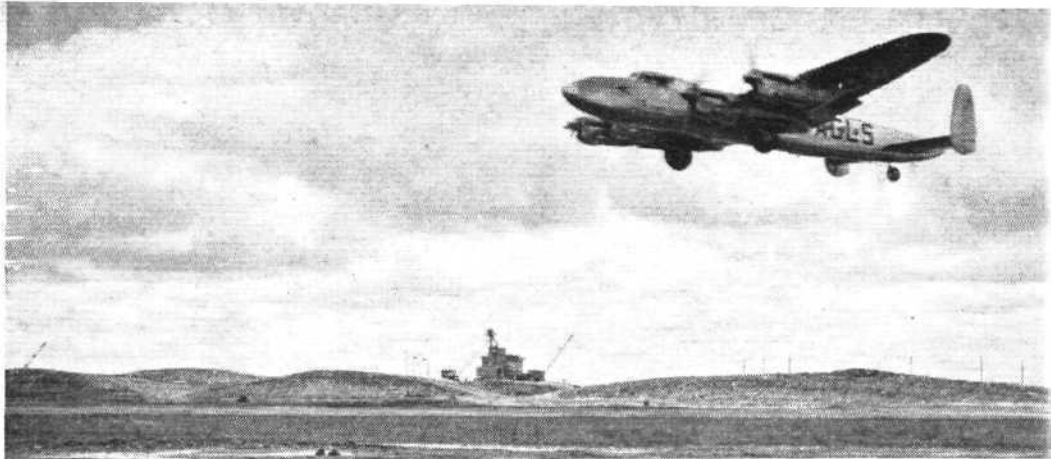
In the same month Lancastrians, carrying only six passengers in sleeping berths, began the then fastest, longest air service in the world—the 63-hour, 13,000-mile Kangaroo service between Hurn and Sydney. On May 28 the service moved to London Airport. This Lancastrian is seen making the first BOAC departure from Heath