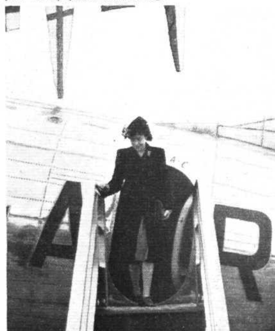
The first wholly post-war 1 mainly on African routes a