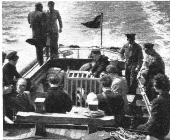
At the end of the war, BOAC began to build its big reputation for flying animals. A very important arrival at Poole in May 1946 was this giant panda . . .