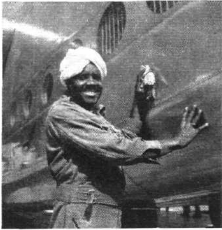
In November 1945, 21-passenger Yorks inaugurated the Springbok service to Johannesburg, in conjunction with South African Airways. At Khartoum this Sudanese cleaner seems particularly pleased