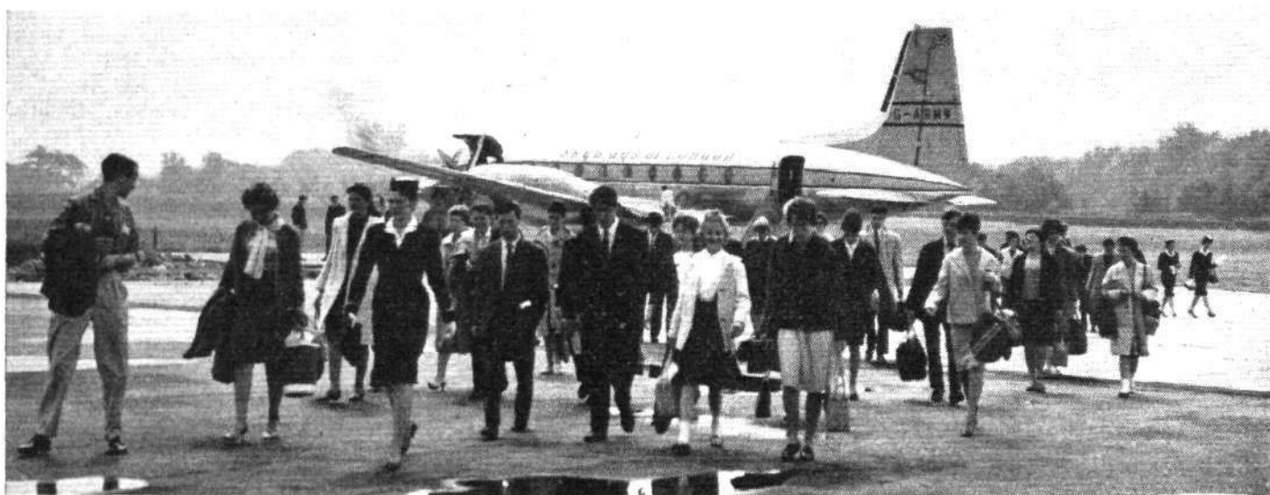
Skyways Coach Air have three 748s in service or on order, flying high-frequency summer shuttles to France from the grass airfield at Lympe

THERE are five operators of the Avro 748 twin Rolls-Royce Dart feeder-liner: the British independents Skyways and BKS; Aerolíneas Argentinas; Brazilian Air Force; and—this year—the Indian Air Force. So far the Series 1 version of the aircraft is in civil operation, and the Series 2 version is in military use. These pictures are representative of the variants that are steadily piling up hours in the United Kingdom, South America and India.