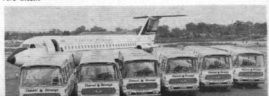
Channel Airways' fleet of Duple 52-passenger coaches (150 cu ft baggage space) on Ford chassis

(147) Elliott - Automation Ltd, Portland Place, London W1 (01-580 5522) Surface communications radio for vehicles and base stations. Computer-controlled data communications systems; applications include warehouse control, passenger information and seat reservation. Flight-deck trainers and visual-display systems trainers. Flight re-