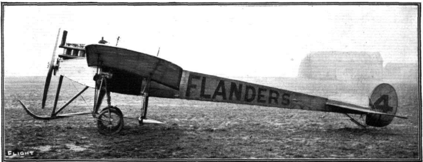
The Flanders monoplane, as seen from the side, giving an idea of the stream-line form of the body.