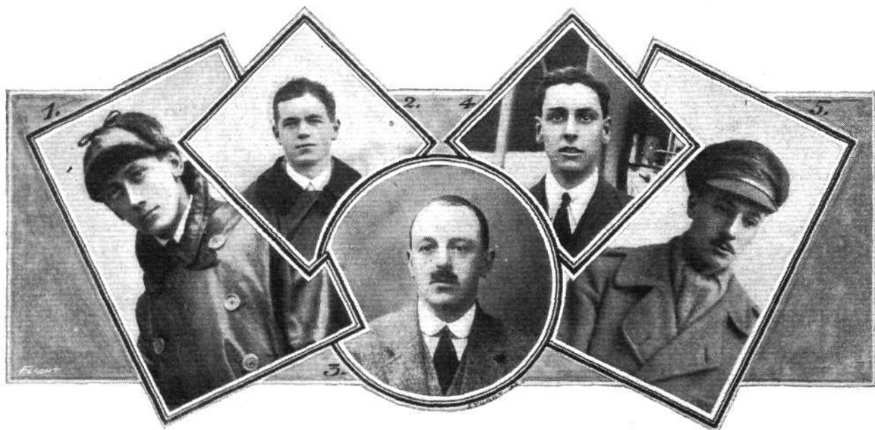
Nos. 1, 2, 4, and 5 are from the F.N.B. Copyright Series of Aviators.

London and Provincial Aviation Co. —Pupils doing rolling last week: Messrs. Snow, Egelstaff, Hardy, and