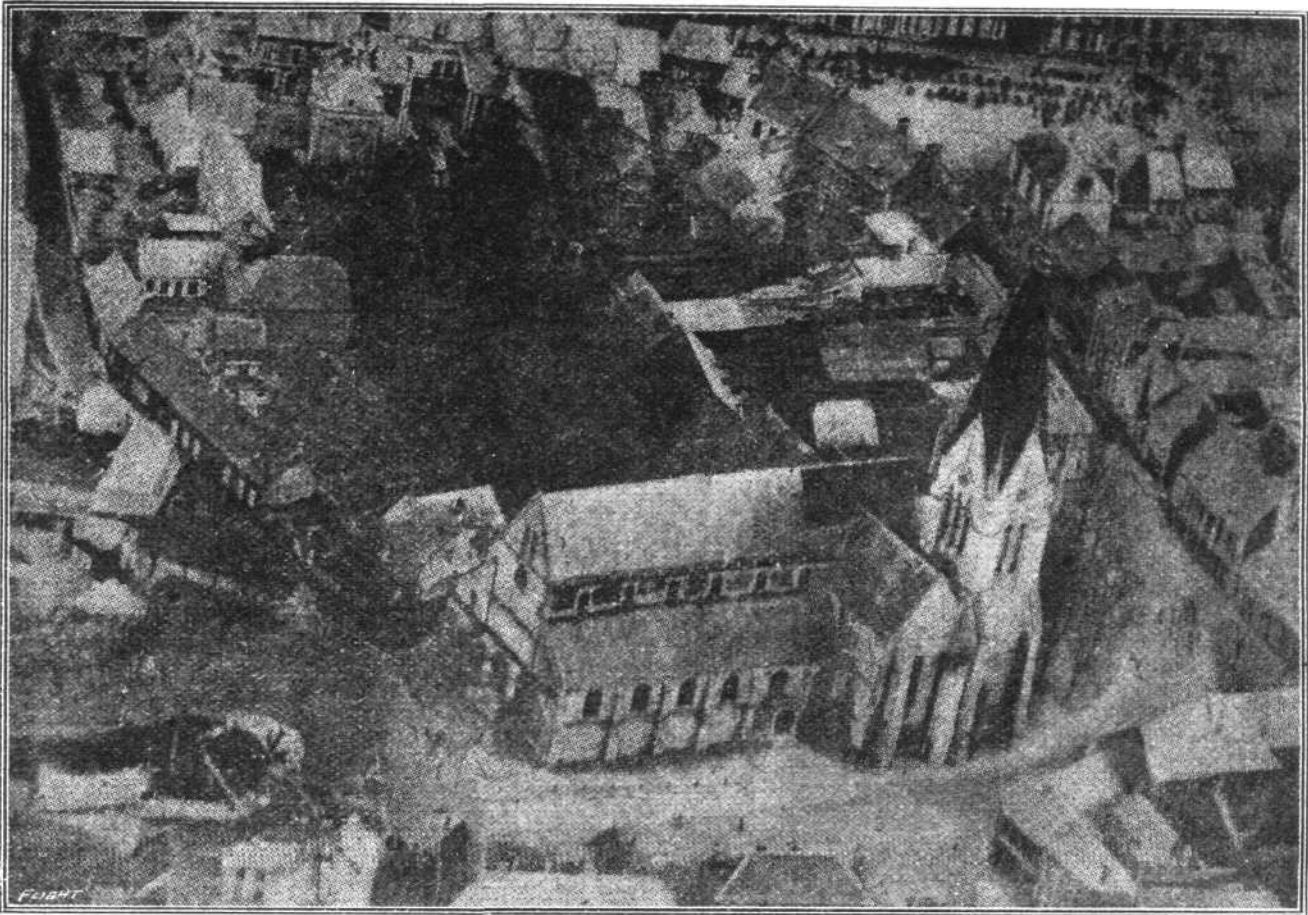
THE RECAPTURE OF NESLE. —On March 19th, 1917, the British cavalry entered the small town of Nesle, which had until then been occupied by the enemy. The above photograph was taken from an aeroplane at a height of 700 ft., and shows the historical event in bird's-eye view.