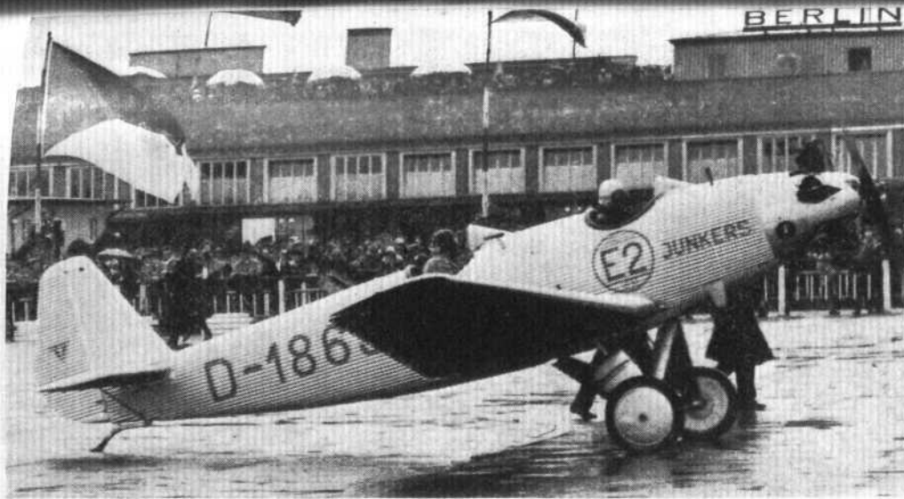
JUNKERS "JUNIOR" : This machine, photographed at the moment of starting from Berlin, is fitted with a Siemens engine. Others of the same type have the Armstrong-Siddeley "Genet."