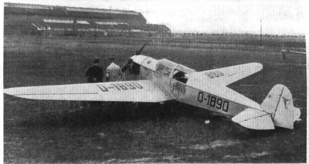
ONE OF THE BFW MONOPLANES : This particular machine is fitted with a Siemens engine, although according to the original list its racing number corresponds to an Argus.