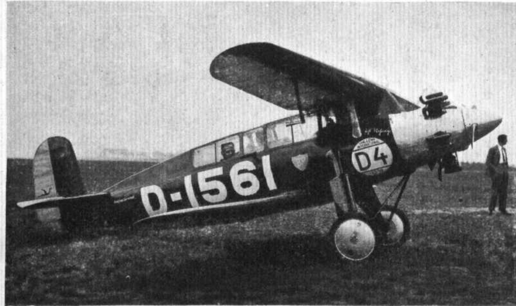
THE DARMSTADT CANTILEVER BIPLANE : Fitted with an Armstrong-Siddeley "Genet" engine, this machine is very carefully streamlined. The view from the Cabin does not appear too good.