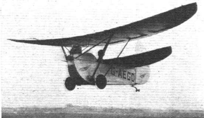
The Abbott-Baynes Cantilever Pou with 30 h.p. Carden engine.

Fitted with Siddeley Cheetah IX engines the maximum speed is 205 m.p.h. at 7,300ft., and the service ceiling is 22,000ft. A single-engine ceiling of 6,250ft. is claimed. Alternative power plants are the Walter Castor II, Wright Whirlwind R.760.E.2, Gnome Rhone 7K.D or 7K.F.S. (in the latter case the top speed is no less than 225 m.p.h.) and Wolsley Scorpio.