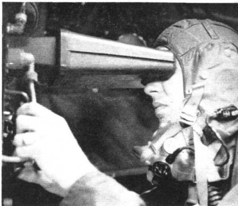
Looking-in on the aircraft's position