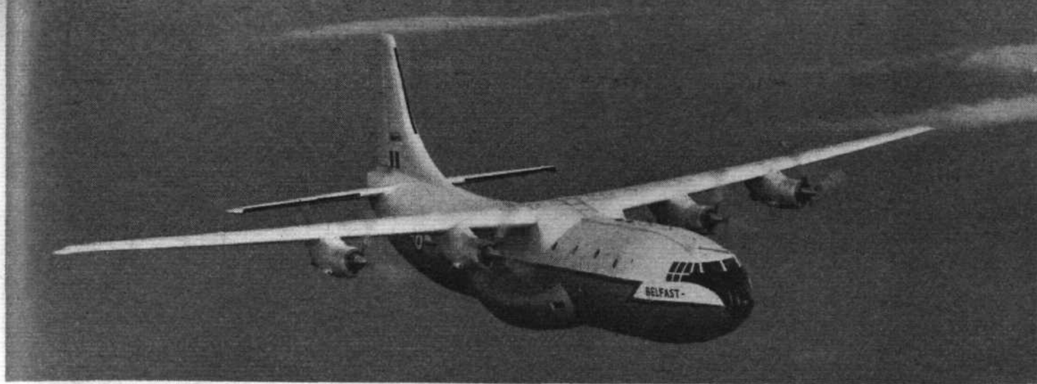
Shorts recently proposed to BEA a 288-seater short-haul version of the Belfast, the RAF's strategic freighter (see page 935)