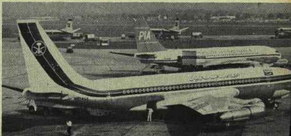
(Above) A Sabena Boeing 727. (Below) Heathrow Airport scene with, foreground, a Saudi Arabian Boeing 720B and behind it a PIA 720B