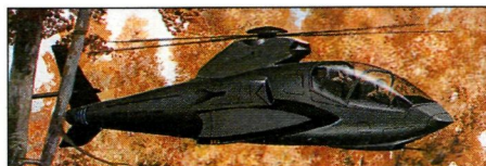
The shape of the next decade. P 36.