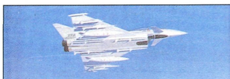
EFA: coming together at last. P 24.

The third V-22 prototype has spread its wings, but the Osprey remains an endangered species. P 22.