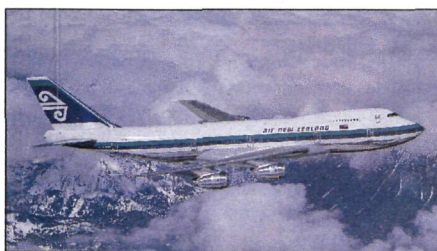
Heading towards Australasian unity? P 32