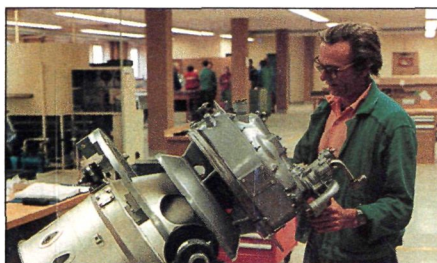
Struggling in the German engine room. P 20

The US Navy's aircraft carrier, USS Forrestal, will soon exchange its 1960s-vintage trainers for the McDonnell Douglas T-45 Goshawk. P 27