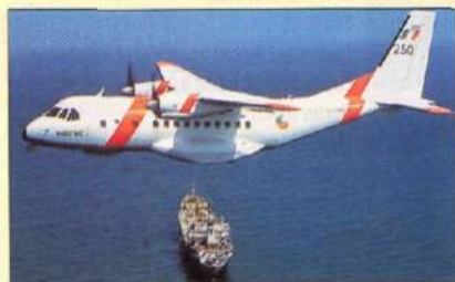
The CASA/IPTN CN.235: searching for orders